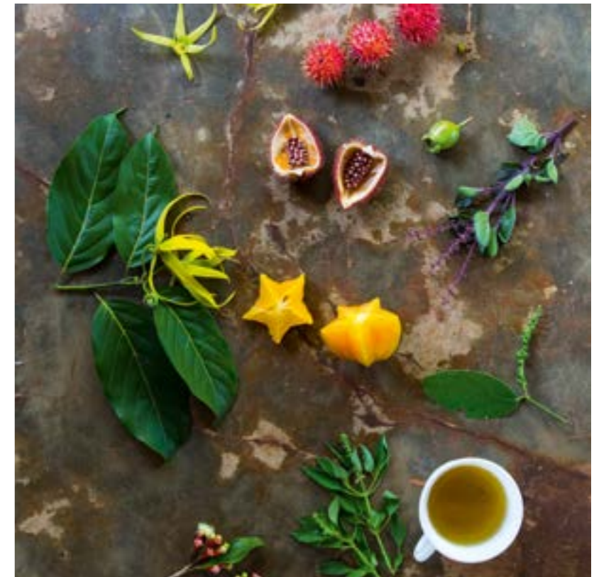
FROM TOP Some of the fruits and spices sampled on the spice tour include carambola, annatto, ylang-ylang and fresh pepper; a curious juvenile batfish following us around in the water off Chumbe Island.

Omari says he was monitoring the marine life around Chumbe Island – counting each urchin, each parrotfish in one of 15 square-metre transacts, something he's done every day for the last two decades – when he was swept several kilometres out to sea in an unforgiving rush of water. He is chuckling, for some reason, as he >